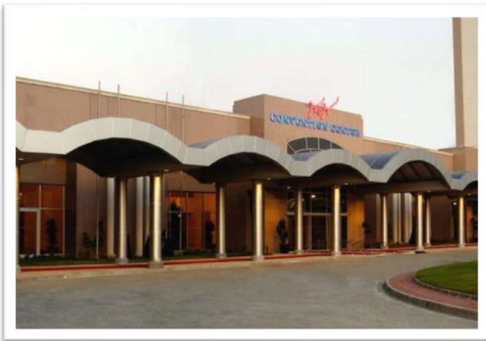
WOW Hotel Congress Center

Starting Time: Friday, 17 th of May 08:00 a.m. Saturday, 18 th of May 08:00 a.m. Sunday, 19 th of May 09:00 a.m.